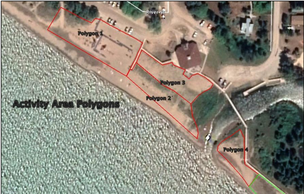
Figure 1. Activity area polygons.